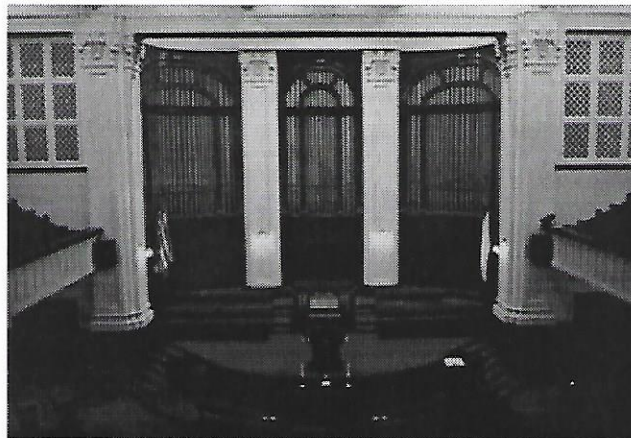
Skinner Opus 190, Grand Avenue Temple United Methodist Church, Kansas City, Missouri