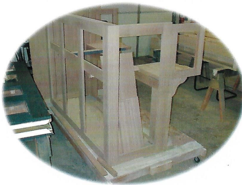
The Console Shell