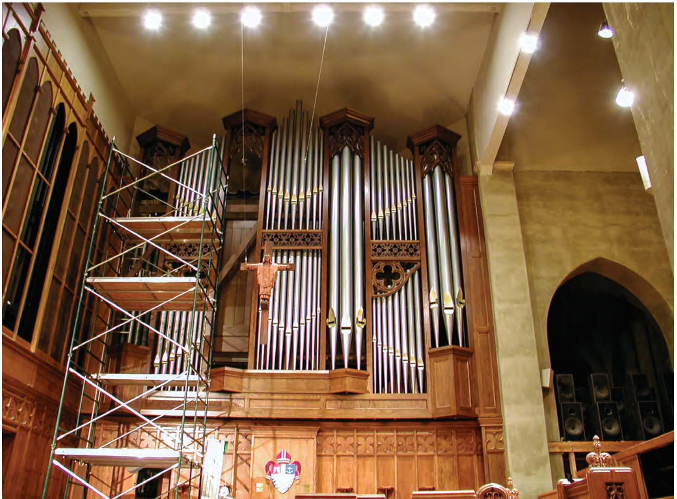
New facade being installed

Following our initial examination of the existing ranks, and determining which were of excellent construction with possibilities for revoicing and rescaling, Green, Johnson, and I created a new specification, using as many of the existing ranks as possible, that would result in an integrated tonal ensemble. No effort was made to use pipes from the divisions found at the time of the last rebuilding; instead, we would place them in the division where they would best fit into the new tonal concept. Green's goal was to achieve a wide variety of tonal and dynamic possibilities for creative and sensitive service playing of the Episcopal liturgy, which