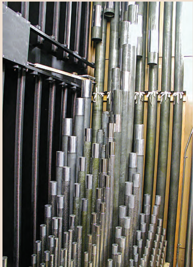
Swell diapason chorus