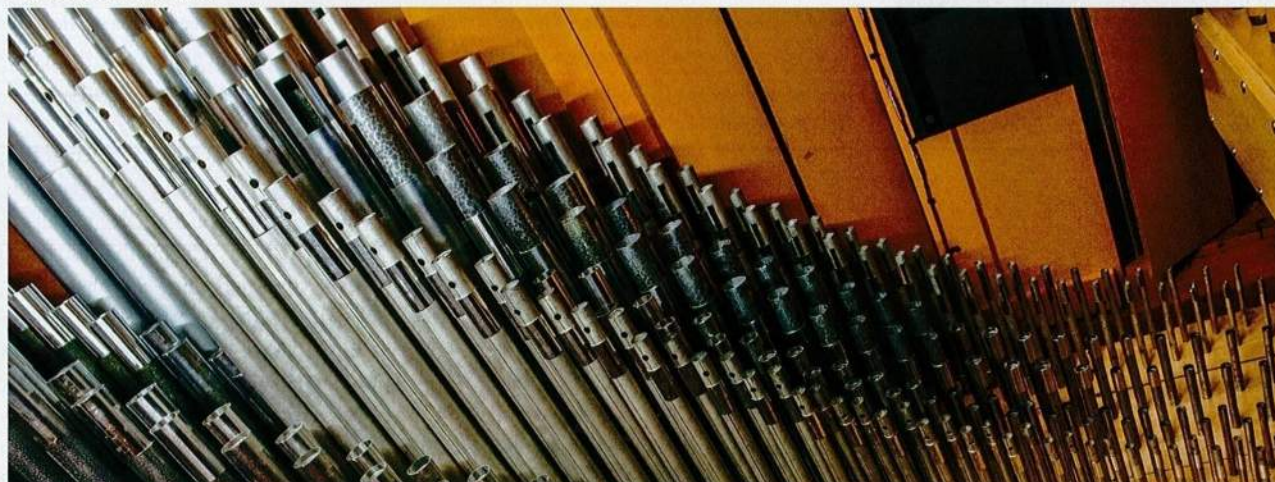
▼ Pipes of the Swell organ