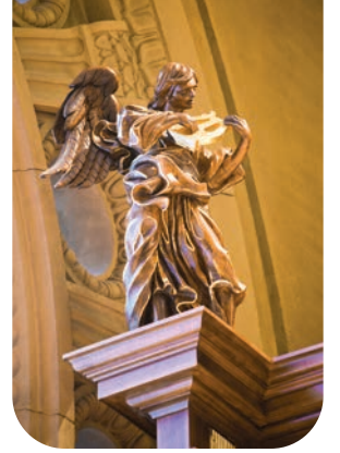
Above: detail of carved angel atop gallery organ casework; opposite page: new gallery casework surrounding the rose window at west end of cathedral

The work on Aeolian-Skinner Opus 1398 was more extensive. Models for expansion and tonal work were Quimby's restoration of Aeolian-Skinner Opus 150A (1954) at the Cathedral of St. John the Divine in New York City, and its complete mechanical restoration and significant