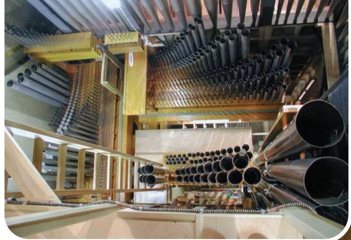
The view looking down into the Great and Bombarde divisions in the gallery organ

telling addition to the Pedal is the extension of the 1963 Aeolian-Skinner 16′–8′ Bombarde, which is now extended full-length to 32′ pitch.